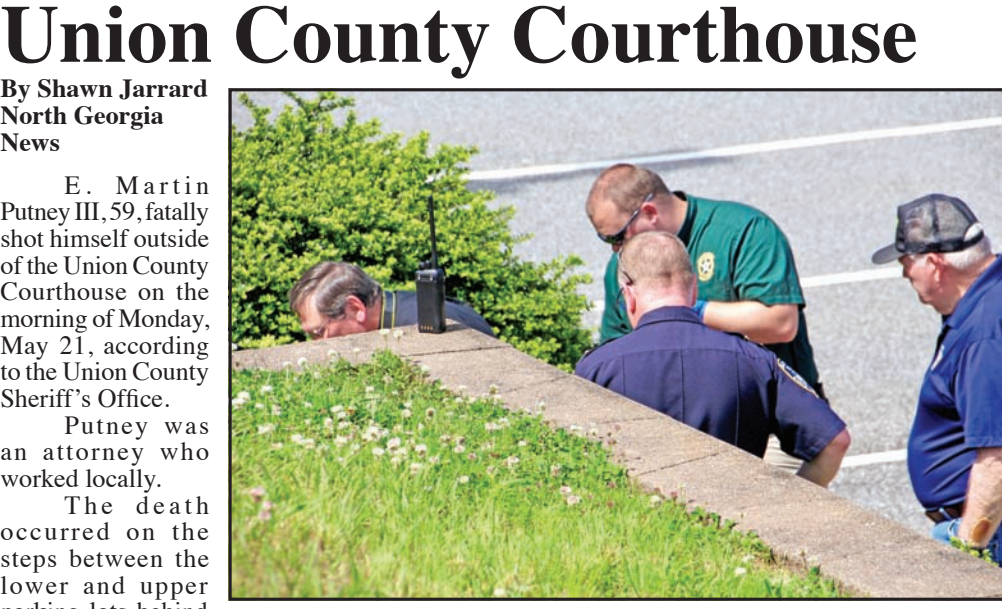
Union County investigators at the scene of the May 21 suicide at the courthouse.

For a brief time Monday morning, both the courthouse and Union County Schools were on lockdown because of the shooting.